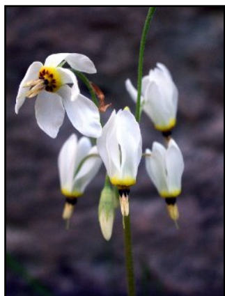
Dodecatheon frenchii – French's Shooting Star

southernillinoisplants@gmail.com www.ill-inps.org