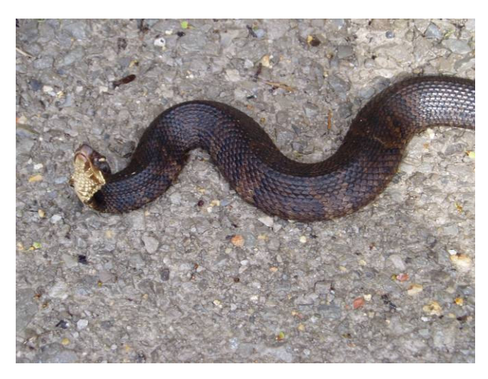
Agkistrodon piscivorus - Cottonmouth

To get there: From Highway 3 south, take the 2<sup>nd</sup> left after crossing the Big Muddy River (LaRue Road, look for sign) and take a left at the base of the bluff to parking area at the SOUTH end of the snake road.