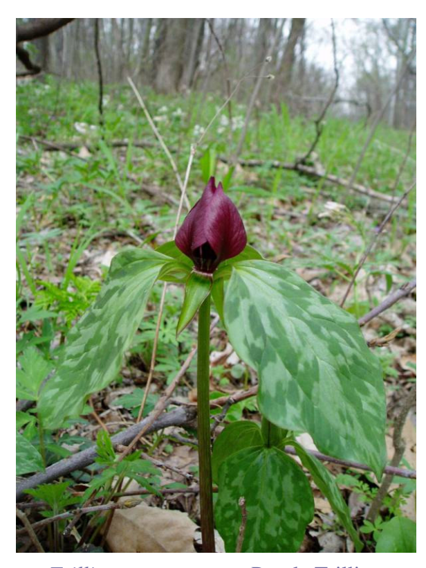
Trillium recurvatum – Purple Trillium