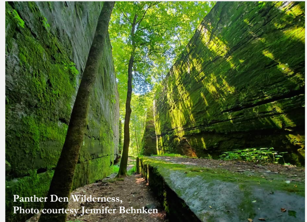
Panther Den Wilderness, Photo courtesy Jennifer Behnken

We have public land that is federal (Corps of Engineers, US Forest Service, US Fish and Wildlife Service), state (state parks, nature preserves, state natural areas, state forests, university lands, etc.), and quite a few non-profit lands in southern Illinois that are open to the public as well (Green Earth Inc., Audubon Society, Clifftop, The Nature Conservancy). There is so much to see and explore, it can be overwhelming, but looking at resources like the different websites of the public land agencies or asking questions on our chapter's Facebook page is a great way to narrow down your choices! I hope to see you on the trail this summer! ~ Chris Evans