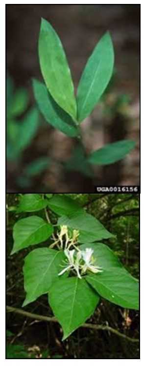
Amur honeysuckle, Lonicera maackii

Japanese siltgrass, Microstegium vimineum