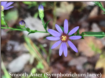
Smooth Aster ( Symphotrichum laeve )

The goal is to highlight the diversity of the NRT's and to make more Americans familiar with these great trails. We're looking for good photos of trail users as well as special facilities, art on the trails, management issues, construction, and volunteers. We also want to see entries that cover the many types and uses of National Recreation Trails throughout America.