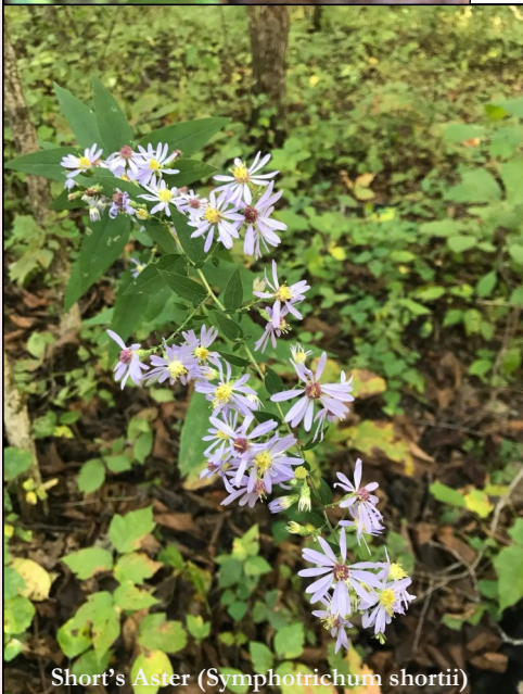
Short's Aster ( Symphotrichum shortii )