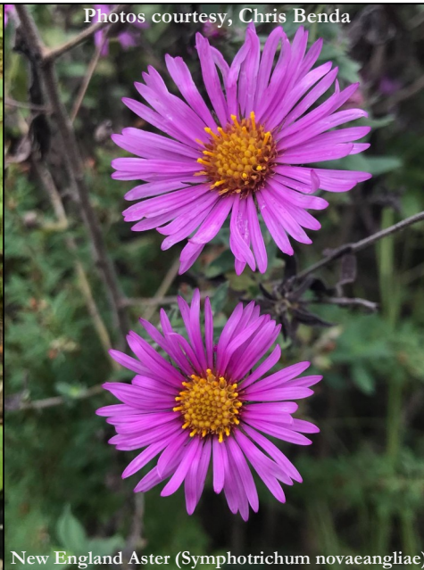
New England Aster ( Symphotrichum novaeangliae )