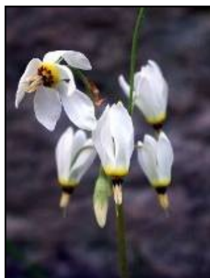
Dodecatheon frenchii – French's Shooting Star

southernillinoisplants@gmail.com www.ill-inps.org