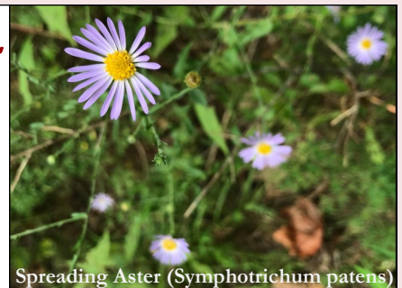
Spreading Aster ( Symphotrichum patens )