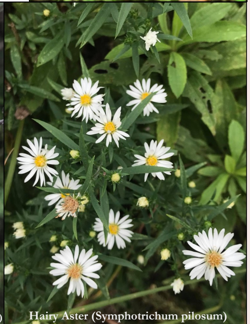
Hairy Aster ( Symphotrichum pilosum )