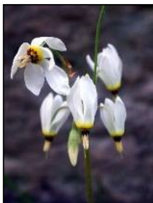
Dodecatheon frenchii – French's Shooting Star

southernillinoisplants@gmail.com www.ill-inps.org