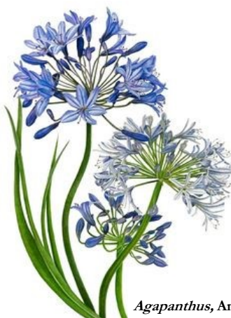
Agapanthus , Amaryllidaceae

Numerous Liliaceae species grow natively or have been introduced to Illinois. Come find out what a true biological lily is & just how much Liliaceae has changed since Linnaeus' time! This program is free and open to the public.