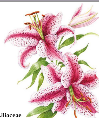
Lilium , Liliaceae