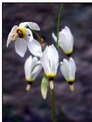
Dodecatheon frenchii – French's Shooting Star

southernillinoisplants@gmail.com www.ill-inps.org