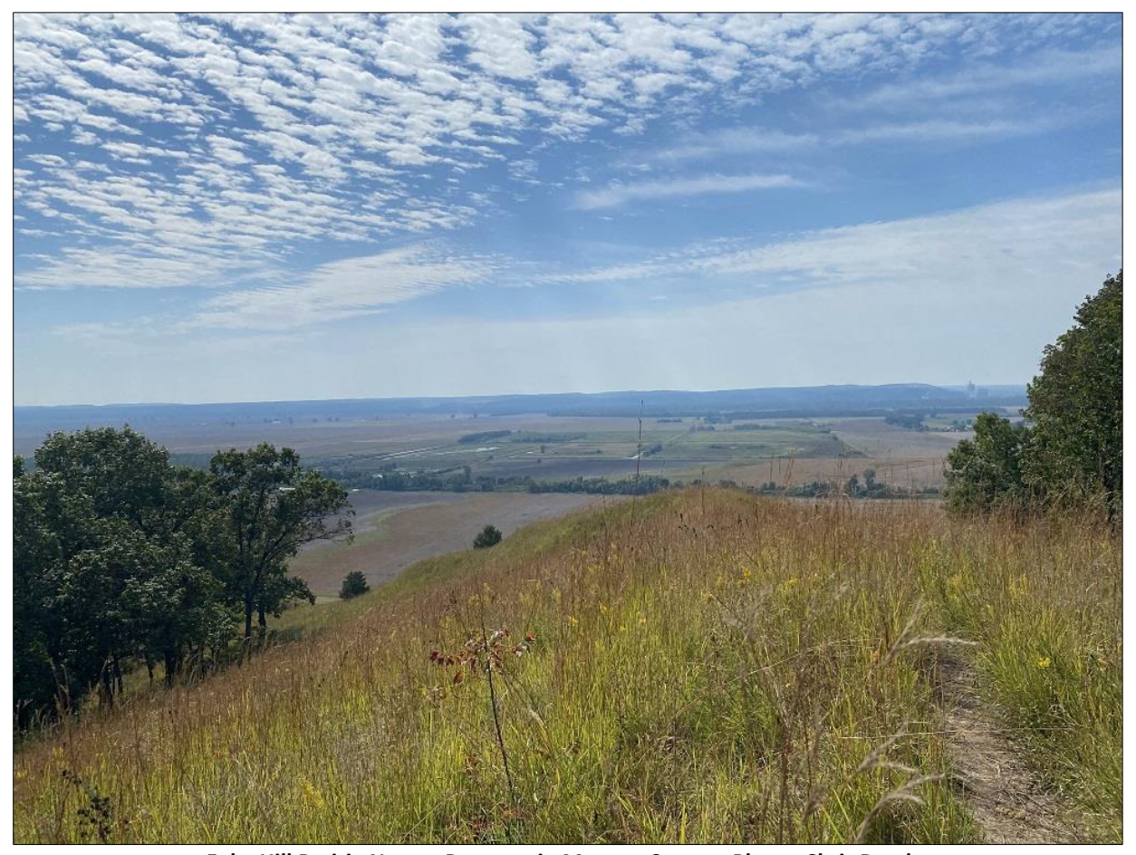
Fults Hill Prairie Nature Preserve in Monroe County.

"...dedicated to the study, appreciation, and conservation of the native flora and natural communities of Illinois."