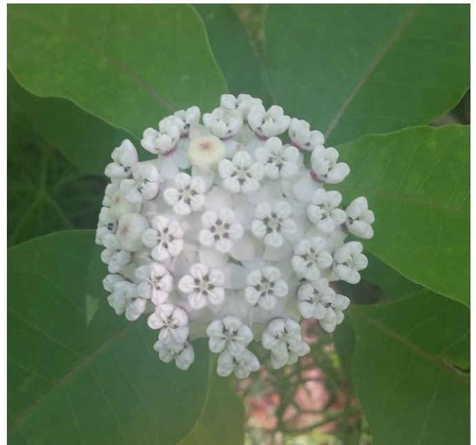
Asclepias variegata (Variegated Milkweed)