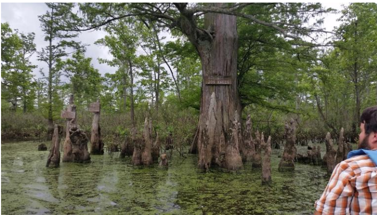
Taxodium distichum (bald cypress) swamp and tree buttresses, Shale Glade.