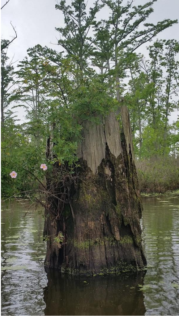
Rosa palustris (swamp rose) on cypress stump