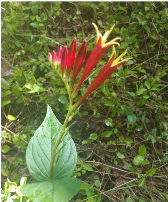
Spigelia marilandica (Indian Pink)