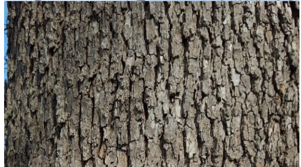
Sycamore