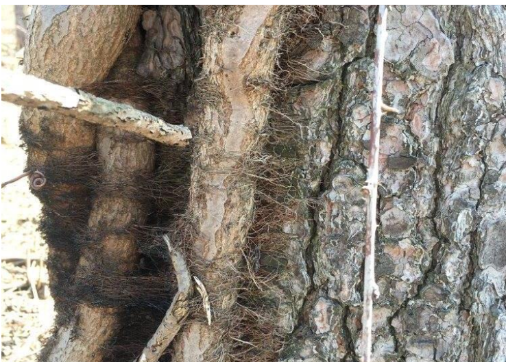
The hairy roots of Poison Ivy