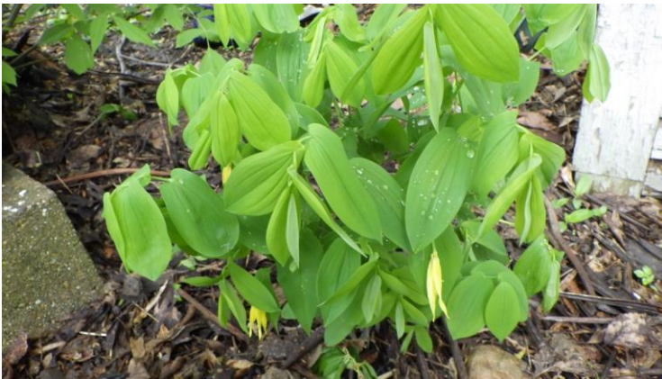
Bellwort ( Uvularia grandiflora)