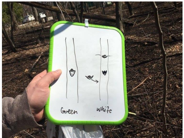
Ash ID tips on the white board