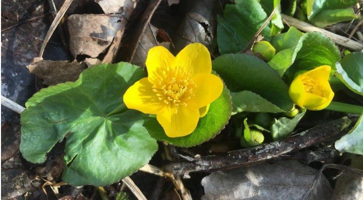
Marsh Marigold