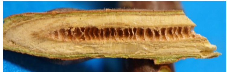
Black Walnut twig with chambered pith