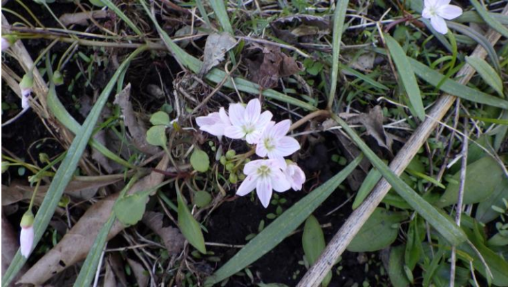
Spring Beauty ( Claytonia virginica )