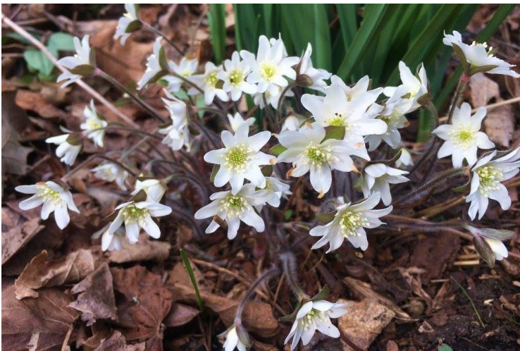
Sharp-lobed Hepatica