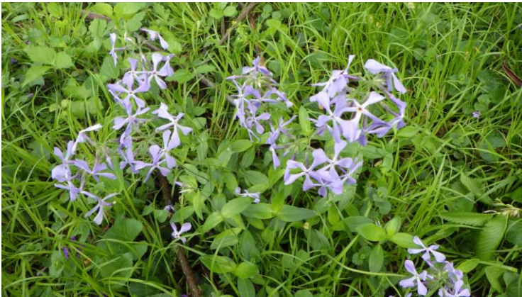
Blue Phlox ( Phlox divaricata )

Spring greetings from Urbana. I just noticed that one of my favorite spring wildflowers, wild blue phlox ( Phlox divaricata ), is blooming in the backyard of my apartment down here. As I sat down to write this note I was wondering if it's likely to be flowering yet in the Chicago area, so I opened my copy of Plants of the Chicago Region (POCR) to check the historic, observed flowering window for that species in the area. April 13 was the earliest date that it was found to be flowering (by the authors) with a midpoint bloom date around May 13. My fingers are crossed for it to be blooming up there by this Saturday when I'll be heading up to Elburn for our native plant walk at Johnson's Mound FP. This native species is abundant at Johnson's Mound and commonly found in woodlands throughout the region. While I know that it's widespread from having seen it in the field, information about its geographic distribution can also be found in POCR.