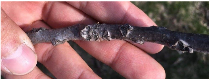
Black Walnut twig with monkey-faced (or E.T.?) leaf scars

I was going to put together a guide with photos from our trip, but the Champaign County Forest Preserves have a great one with color photos available for download here .