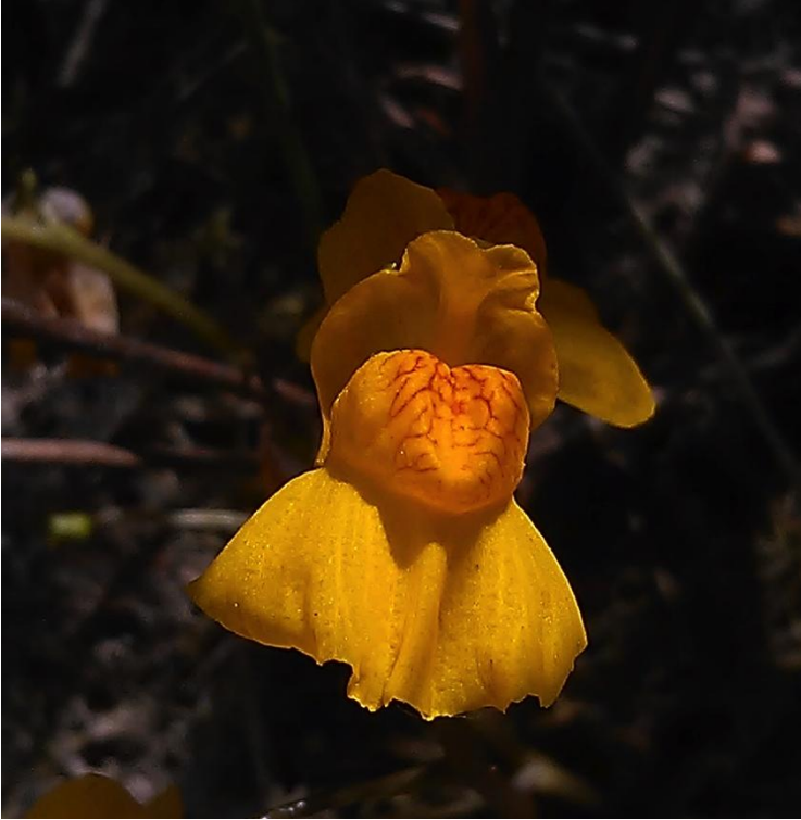
Common Bladderwort – Flower close-up.

They typically grow in nutrient poor habitats. The finding has received lots of local attention, with a nice write-up by WTTW ( link here ) based on an interview with one of our trip attendees, Greg Spyreas (INHS).