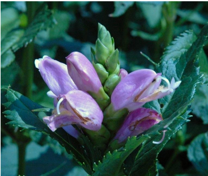
Pink Turtlehead ( Chelone oblique )

On Saturday, August 1 st , around 15 folks got together and hiked through the Montrose Beach Dunes natural area in Chicago. We had full sun and temperatures in the 80's and it was a beautiful day to be hiking on a beach. The beautiful weather was only overshadowed by the beauty we got to see in the form of the interesting plants that Montrose has to offer.