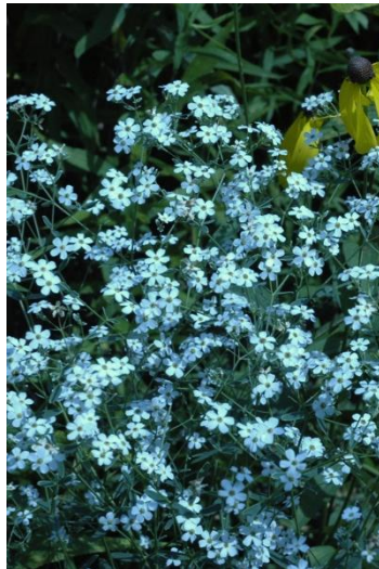
Flowering Spurge ( Euphorbia corollata )