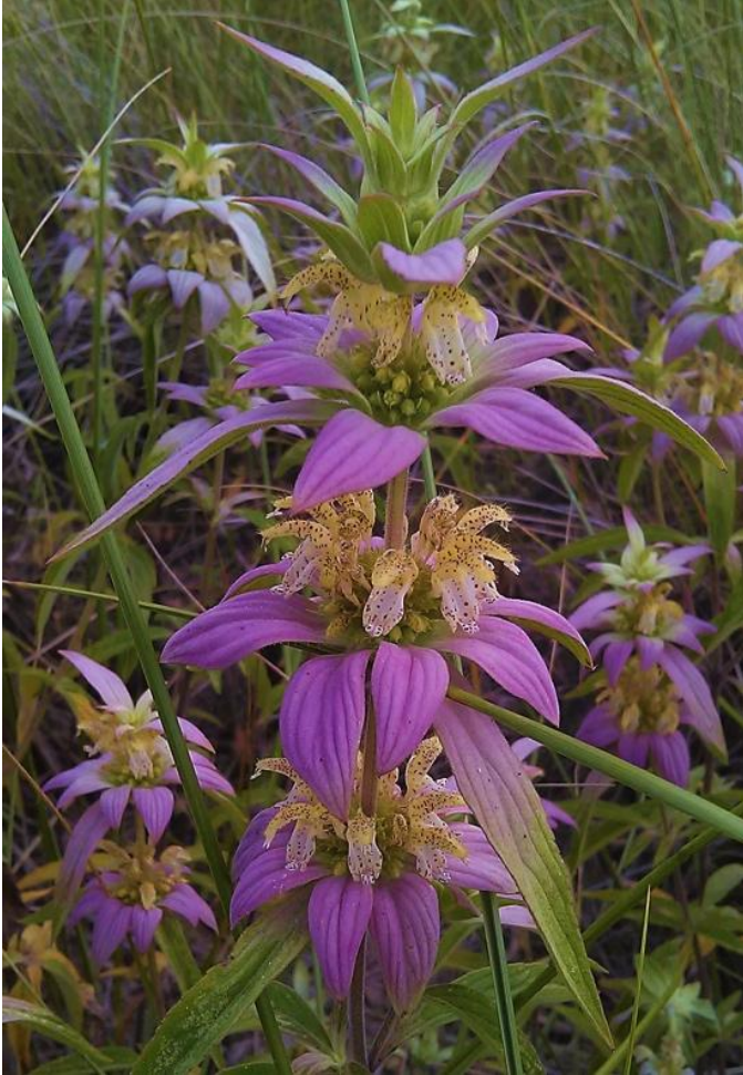
Spotted Bee Balm ( Monarda punctata )

We hiked along the designated trails and saw a number of blooming plants that included Kalm's lobelia, ( Lobelia kalmii ), Kalm's St. John's wort ( Hypericum kalmii ), obedient plant ( Physostegia virginiana ) and countless others. The three species I just listed are only a small subset of plants that we saw on the trip, and this brief snapshot doesn't begin to do justice to this cool site. Montrose is home to over 20 state listed plant species and we got to see several of those on our hike. In next month's newsletter I'll include the full list of plant species we saw and even that will fall shy of fully describing how cool Montrose Beach Dunes is.