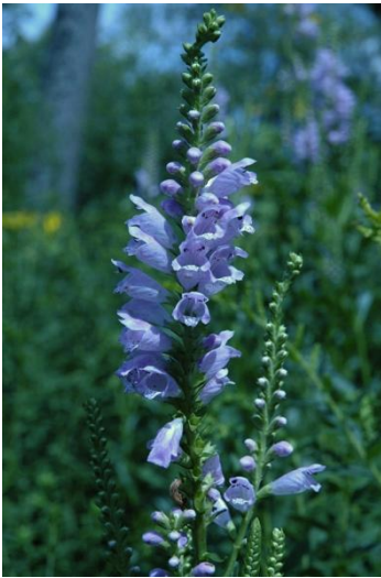
Obedient Plant ( Physostegia virginiana )