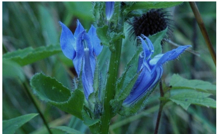
Great Blue Lobelia ( Lobelia siphilitica )

Woodland and stream additions: American Basswood ( Tilia americana ), Cardinal Flower ( Lobelia cardinalis ), Joe Pye Weed ( Eutrochium fistulosum ), Obedient Plant ( Physostegia virginiana ), Orange Jewelweed ( Impatiens capensis ), Osage Orange ( Maclura pomifera ), White Turtlehead ( Chelone glabra linifolia ).