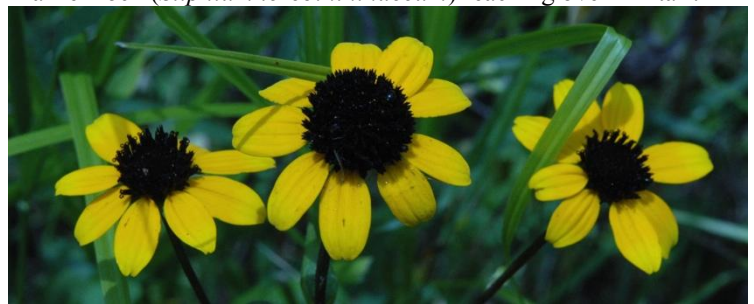
Brown-Eyed Susan ( Rudbeckia triloba )?

Next stop was along the building perimeter to observe the planted native landscaping. We quickly passed through the Ball Horticultural gardens to reach the wet wooded area where we picked up a number of additional species along the creek and in the moist uplands including White Turtlehead and Obedient Plant. Special thanks to the attendees for knowledge of the species (and