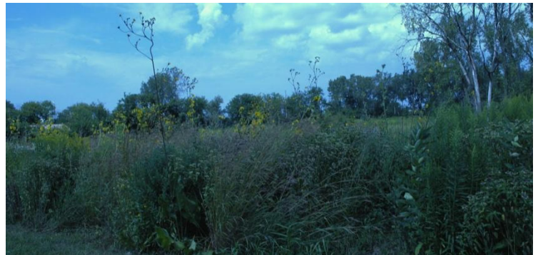
Prairie Dock ( Silphium terebinthinaceum ) reaching over 12' tall!

Thanks to the hardy group who joined me on a very warm Sunday (August 16) to visit the natural areas and native plantings at the gardens. Natural areas were planted, are being monitored and maintained by Pizzo Associates. After a brief discussion of the history of the area and the plant products offered by Ball, we first visited the created wetland. Over 100 species of plants (seed and plantings) were used in the creation/restoration of this area. The soils are rich, and the plants correspondingly tall. There was an abundance of grass, sedge and composite species, plus a large number of insects using the area.