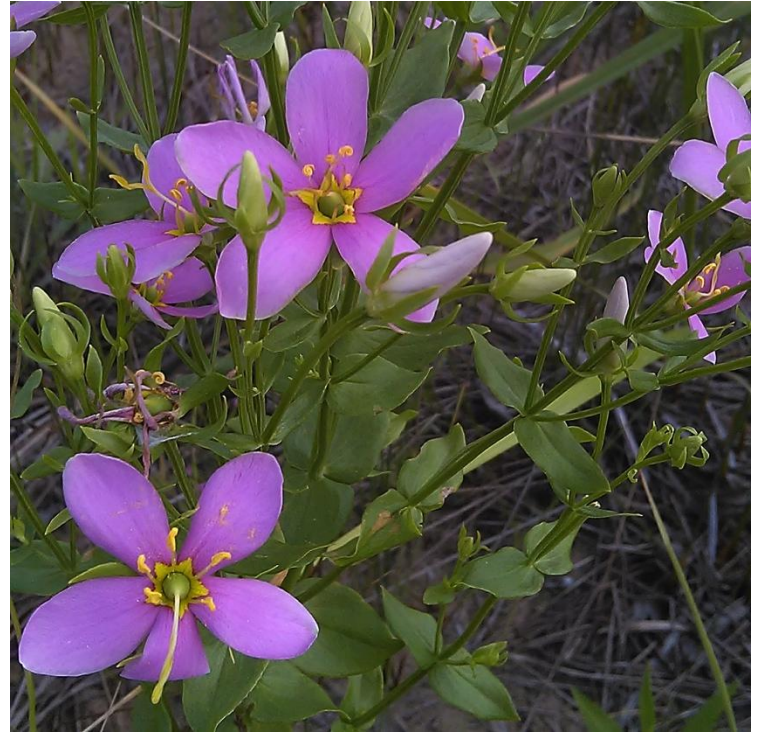
Common Rose Pink ( Sabatia angularis )

Star of the trip – the Common Bladderwort ( Utricularia macrorhiza )! This plant is known to the Chicago area but has not been seen at this particular site before, despite lots of recent plant surveys. It is likely a tribute to the hard work of volunteers and restoration efforts. Utricularia are carnivorous plants, feeding on aquatic invertebrates that it traps in the submerged bladders.