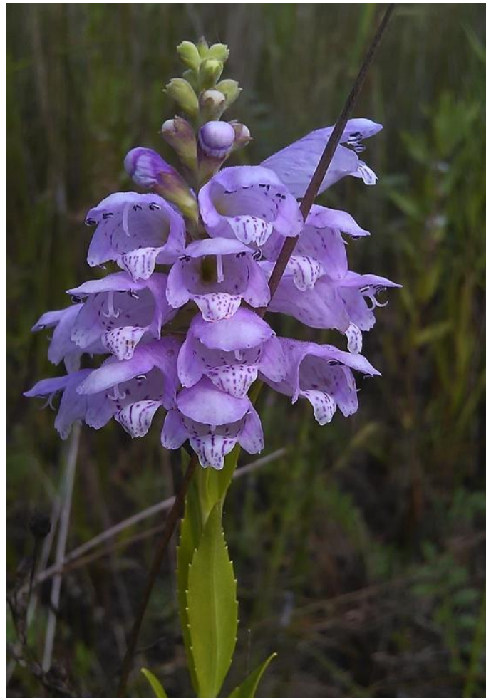
Obedient Plant ( Physostegia virginiana )