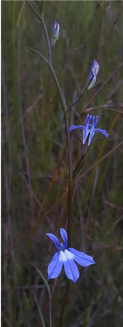
Kalm's Lobelia ( Lobelia kalmii )