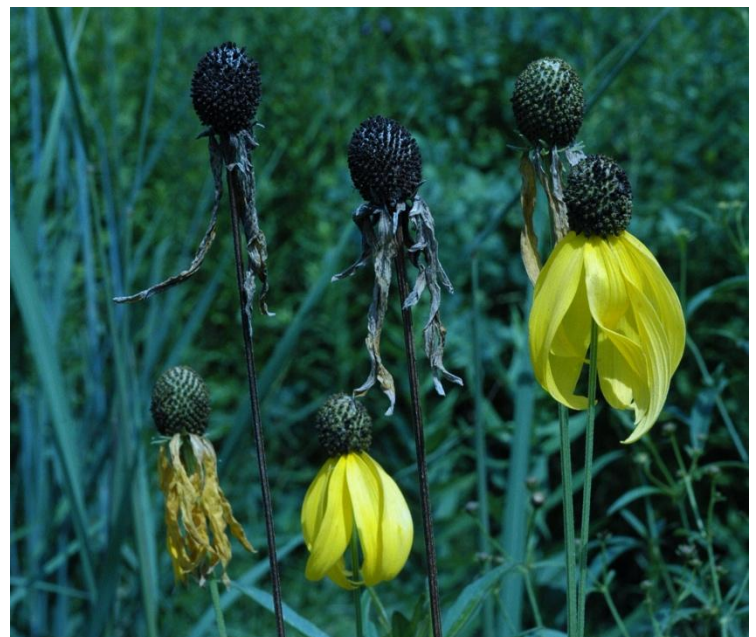
Yellow Coneflower ( Ratibida pinnata )

Send us an email message: northeast-inps@gmail.com or write me directly at lindamprince@gmail.com