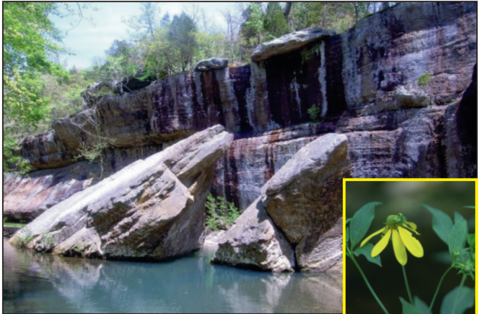
Swimming hole. Cutleaf coneflower (inset)