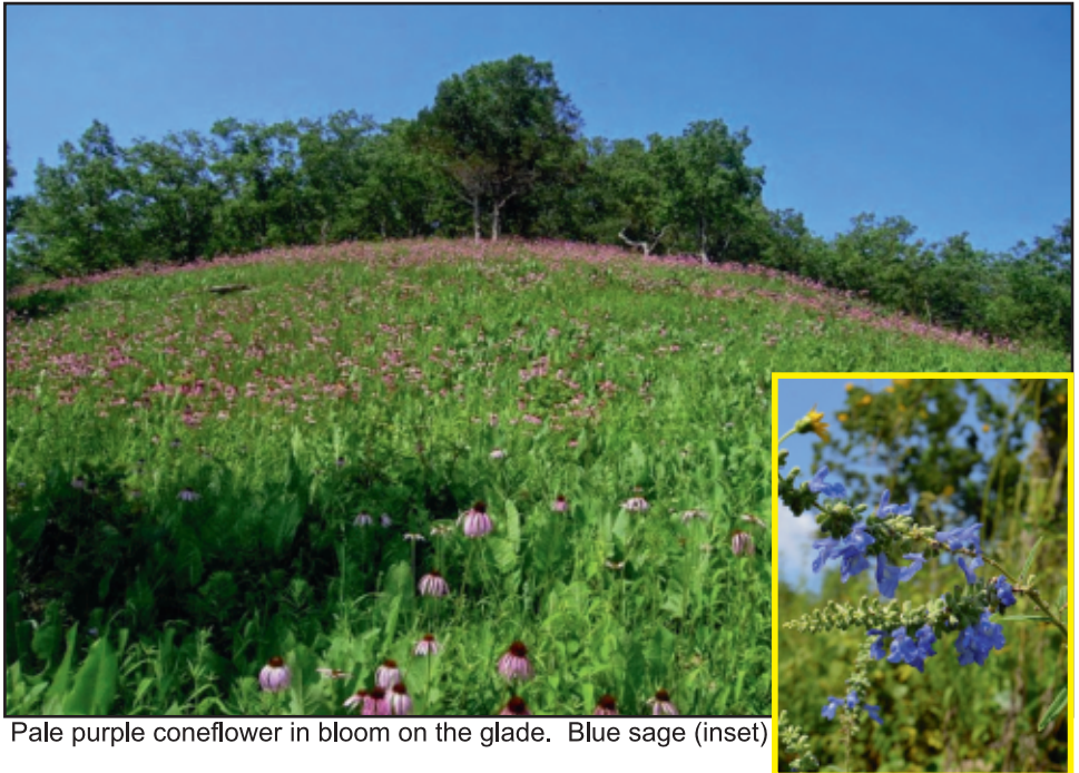
Pale purple coneflower in bloom on the glade. Blue sage (inset)