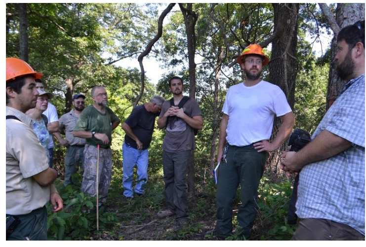
Shawnee National Forest resource staff and Illinois Native Plant Society members discuss the recent management on the hill prairies.

One of the unique natural areas in southern Illinois is the Ozark Hill Prairies Research Natural Area. This site occurs in Alexander County and is managed by the Shawnee National Forest. Land managers at the Shawnee National Forest became concerned when natural openings in the forest, identified as grade A hill prairies during the Illinois Natural Areas Inventory in 1976, became so overgrown by 2013 that they were barely discernible. Hardly a prairie plant could be found under the invading brush. They had to make a plan to rescue the prairies.