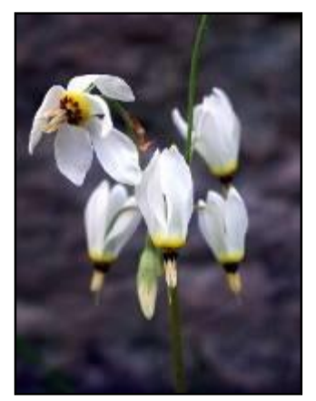
Dodecatheon frenchii – French's Shooting Star