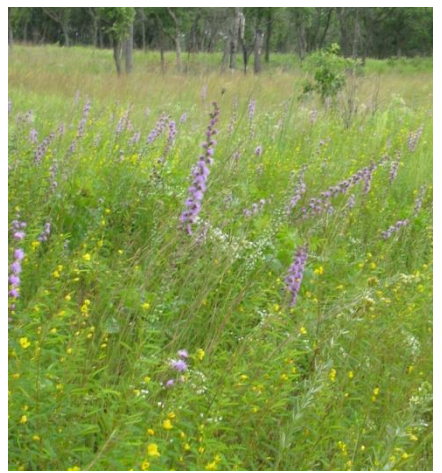
Marsh Blazing Star (Liatris spicata)