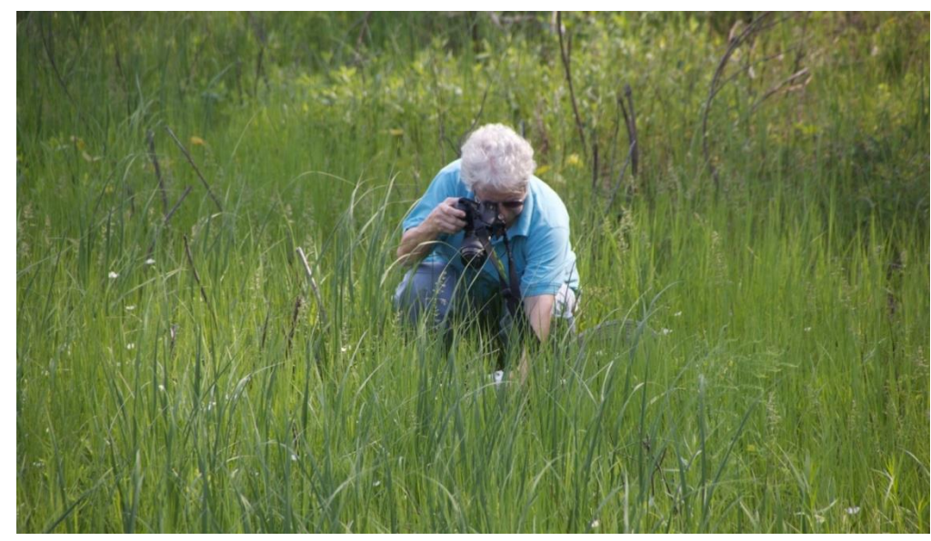
The author at work

While some Carex species are meter or more tall, especially in sedge meadows, some are small and easily overlooked.