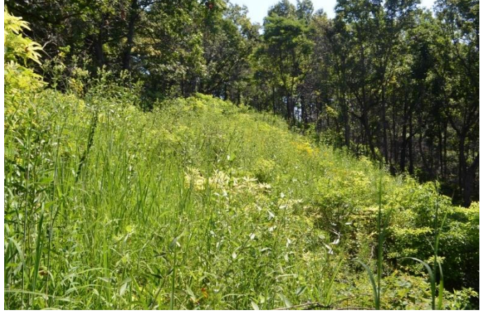
Hill Prairie natural community at Ozark Hill Prairies RNA

The biologists and staff at the Shawnee National Forest are obligated to follow best management practices through a transparent process that allows for public engagement and input. This can be a time-consuming and costly process, but the dedicated natural resource staff were able to get their plan approved and began management work at the Ozark Hill Prairies in the late fall of 2014. Because this site is so remote and the terrain is so hilly and steep, they had their work cut out for them. They had an ambitious plan to restore the hill prairies, and they were up for the challenge.