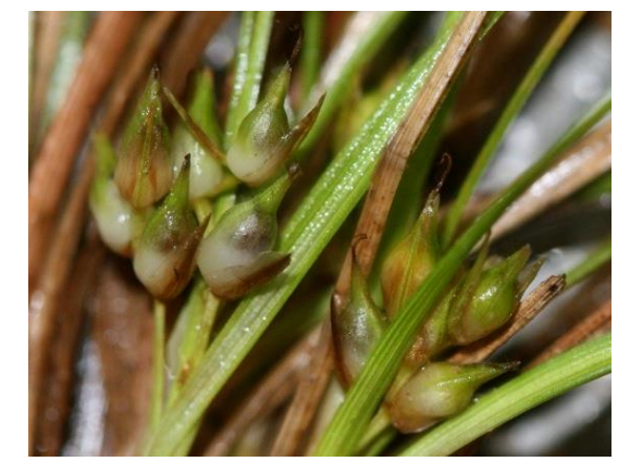
Shaved Sedge (Carex tonsa)