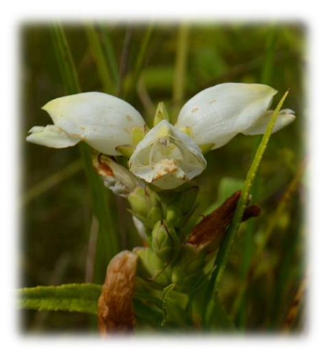
White Turtlehead (Chelone glabra)

In the seep community at Evans-Judge, we observed the state-endangered early dark green rush ( Scirpus hattorianus ) which had already formed small, dark black seed heads. This population is colonizing an area where common reed ( Phragmites australis ) has been sprayed. We also enjoyed seeing hundreds of common boneset ( Eupatorium perfoliatum ) and numerous white turtlehead ( Chelone glabra ) in bloom, along with a large colony of Queen of the Prairie ( Filipendula rubra ), which appears to be incapable of setting seed, due to self-sterility issues. The District is considering working with other agencies to reestablish genetic diversity here and a reproductive colony.