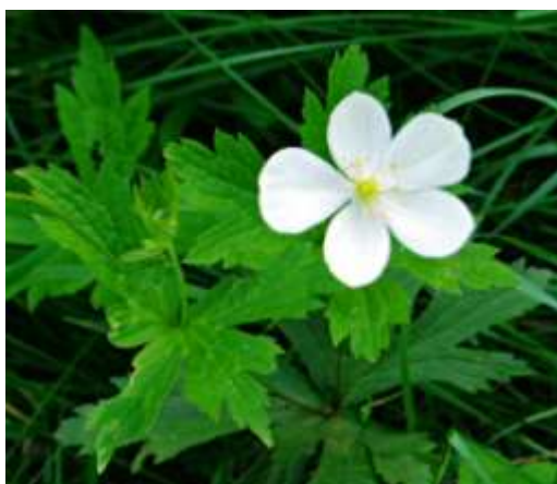
Anemone canadensis